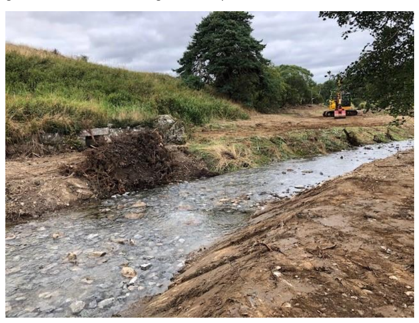
Fig 2, A meander has been added to the section upstream of the weir.